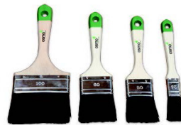
7 Osmo Brush