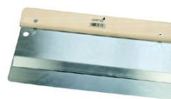
11 Osmo Double putty