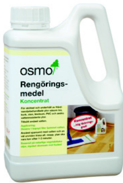
1 Osmo 8016 Cleanser