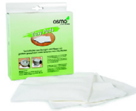
3 Osmo Easy Pad