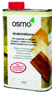
2 Osmo 3029/3087 Maintenance wax