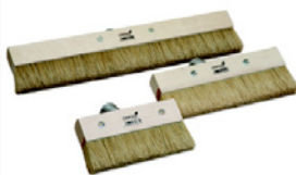
9 Osmo Brush