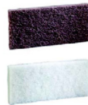
8 Red/white Doodlebug